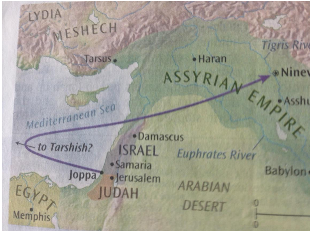
Closer view of eastern Mediterranean (From NLT Illustrated Study Bible , p. 1568).

(From NLT Illustrated Study Bible , p. 1569).